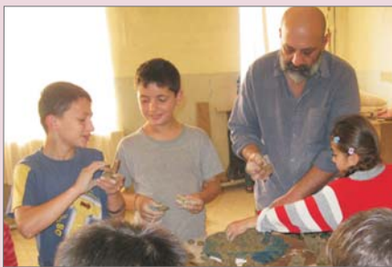
A Step Toward Sustainability ..... 2

77, Nutsbidze St., Tbilisi 0177, (+995 32) 397174 lenakiladze@hotmail.com