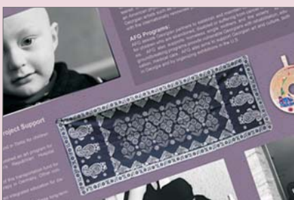
AFG at the 2nd International Symposium of Georgian Culture ..... 5