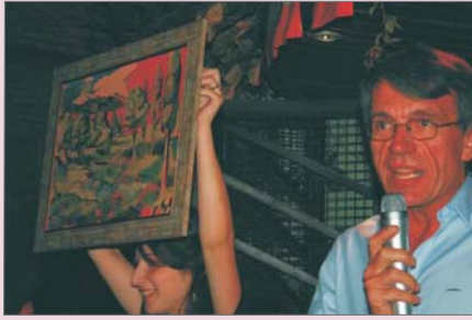
Emergency Fundraiser for Leukemia Patients ..... 3